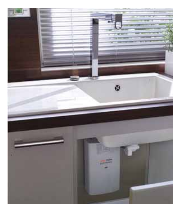
As Zip policy is one of continuous product improvement, changes to specifications may be made without prior notice.

The terms Zip, InLine and CEX are Trademarks